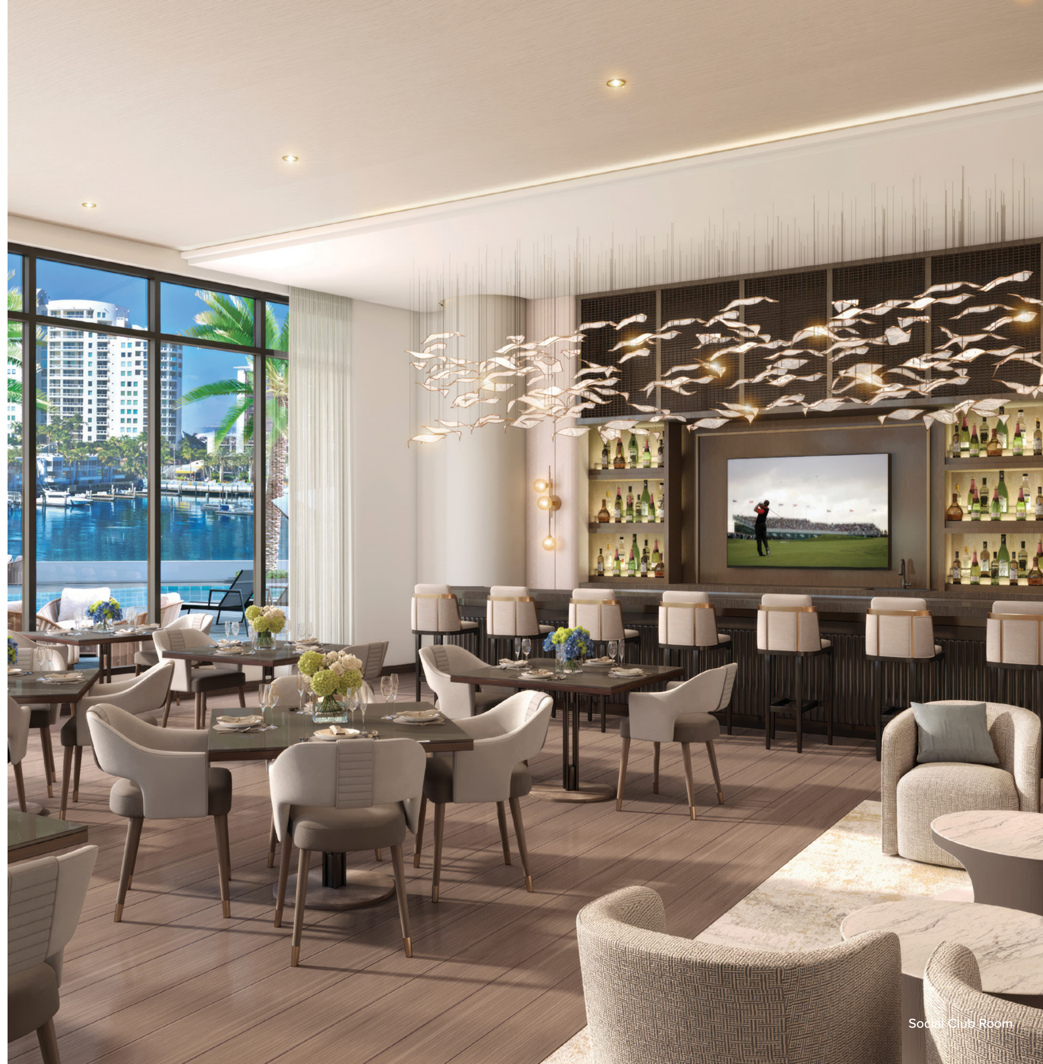
Social Club Room