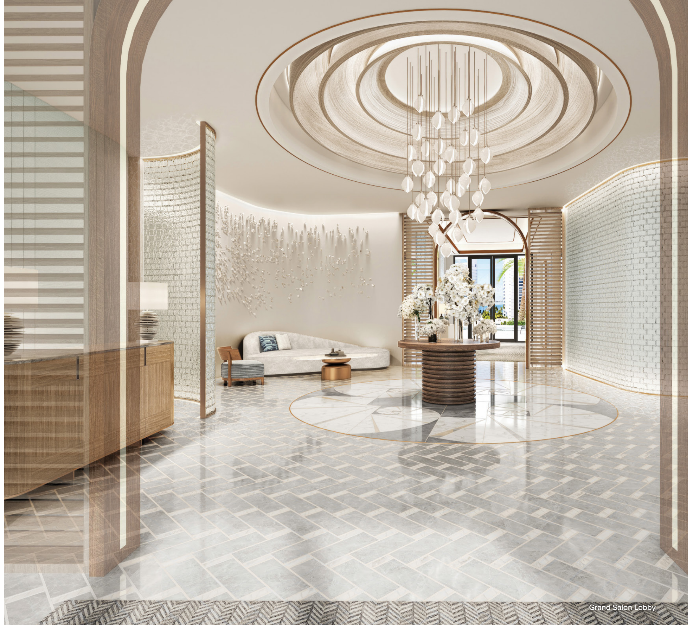
Grand Salon Lobby